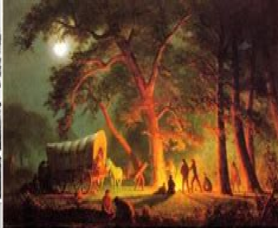
Oklahoma and Indian Territories