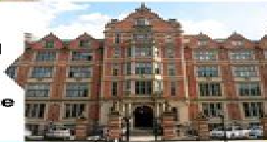
University of Edinburgh