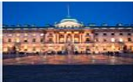
King's College of London