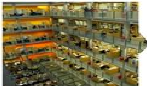
Imperial College London