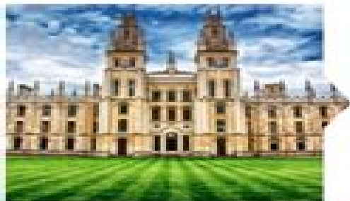
University of Oxford