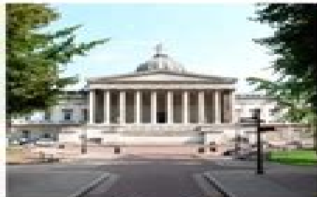
London School of Economics and political science