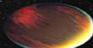
HD 209458 B