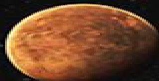
GLIESE 876 D