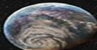
GLIESE 581 D