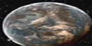
GLIESE 647 CB