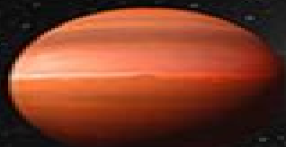
EPSILON ERIDANI B