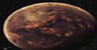
GLIESE 647 CC