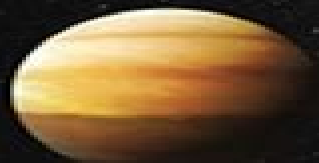
51 PEGASE B