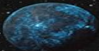
GJ 1214 B