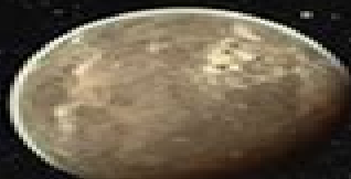
HD 40307 B