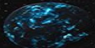
HD 189733 B