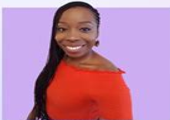
MIN NOBELLE HOST