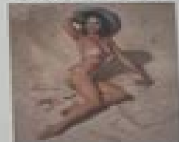
Keywords: child sexual abuse; disclosure; self-blame

November / December / November / December / 2000