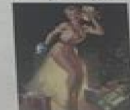
© 2000 Blackwell Science Ltd, Journal of Internal Medicine 247: 399–404

Downloaded from http://www.sagepub.com at NANYANG TECH UNIV LIBRARY on June 11, 2015