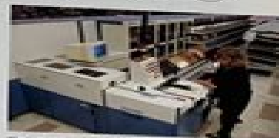
©2004 Blackwell Publishing Ltd Journal of Internal Medicine 255: 103–110