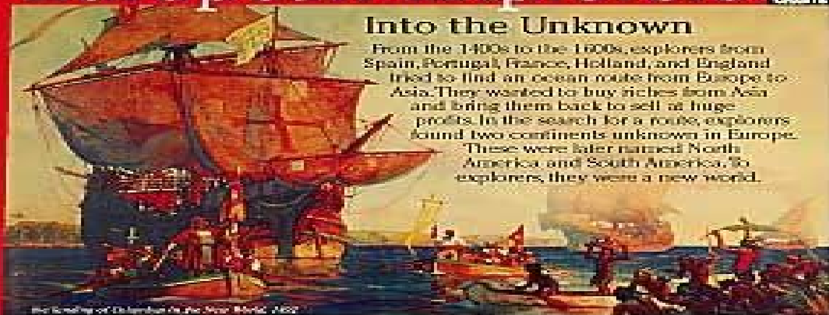
Reproduction of Columbus's ship, the Santa Maria, 1492