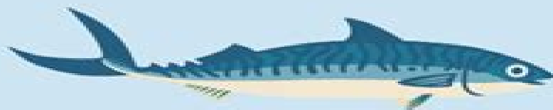
Certain types of fish.