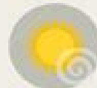
Prolonged exposure to the sun