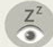
Lack of sleep