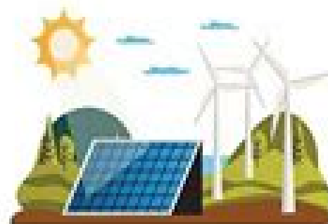
Wind Power and Solar Energy