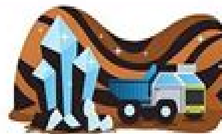
Precious Metals, Minerals, Rocks