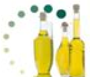
FATS AND OILS

Sources for fiber include whole grains, whole fruits and vegetables.