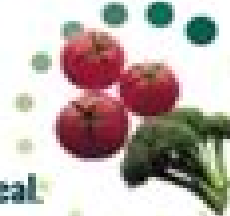
FRUITS AND VEGETABLES

1 slice of bread 1 cup of breakfast cereal 1/2 cup of pasta, cooked rice, or cooked cereal 6oz - 170 gr