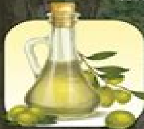
Olives & Olive Oil

The Bible identifies many foods that are beneficial to good health and longevity. This is important because your diet can have a profound impact on your physical, mental, emotional and spiritual well being.