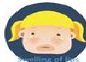
Swelling of lips /of eyelids