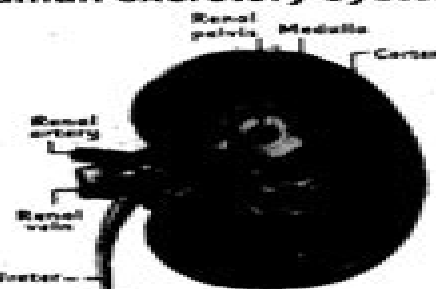
Internal structure of kidney