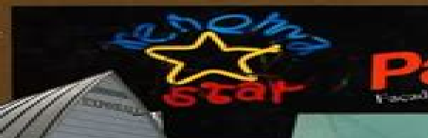
Part 3 Facades and Signboards in Japan