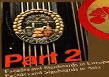
Part 2 Facades and Signboards in Europe Facades and Signboards in Asia