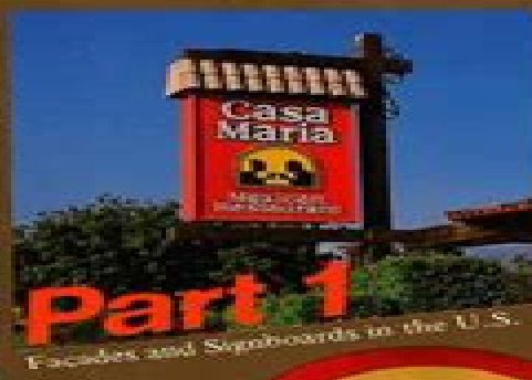
Part 1 Facades and Signboards in the U.S.