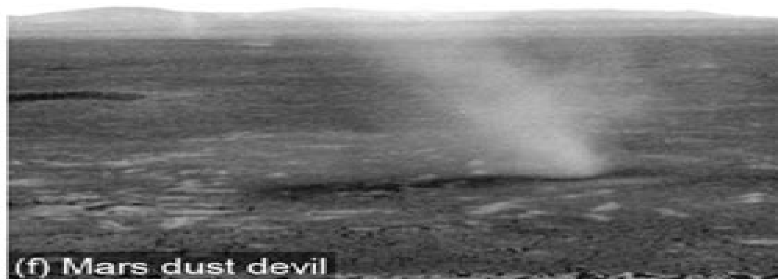
(f) Mars dust devil