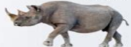
West African Black Rhinoceros