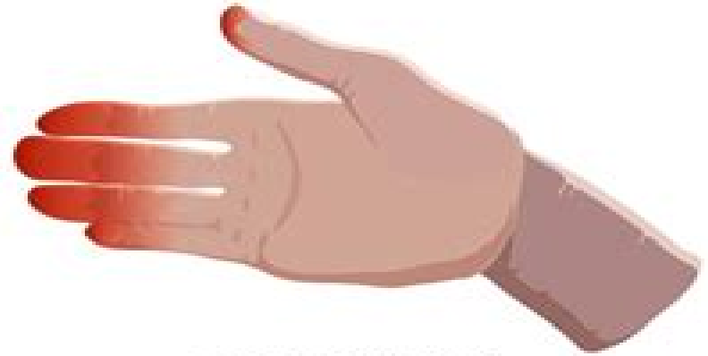
superficial (first degree) burn