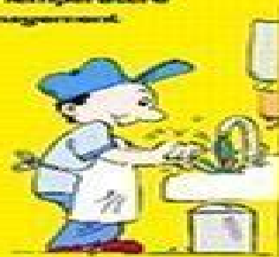
Proper Personal Hygiene