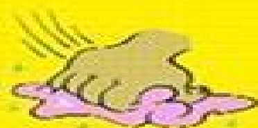
Cleaning & Sanitizing