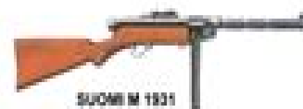
SUOMI M 1931