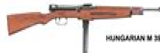
HUNGARIAN M 39M