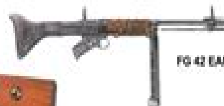
FG 42 EARLY VERSION