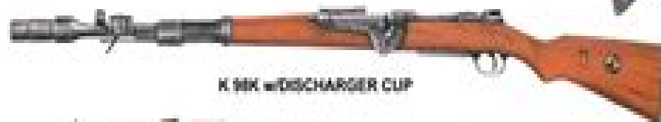
K 98K w/DISCHARGER CUP