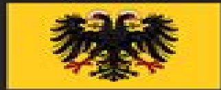
HOLY ROMAN EMPIRE