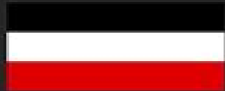
NORTH GERMAN CONFEDERATION