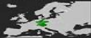
CONFEDERATION OF THE RHINE