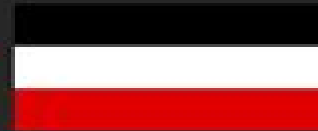
- GERMAN REICH -