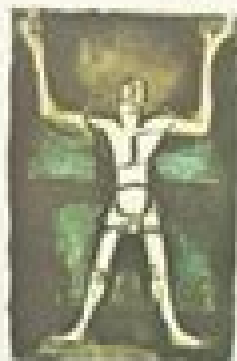
© 2004 Blackwell Publishing Ltd Journal of Internal Medicine 255: 105–112