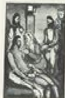
Fig. 2. (a) Average (b) standard deviation of the normalized shear stress distribution.

© 2000 Blackwell Science Ltd, Journal of Internal Medicine 247: 399–405