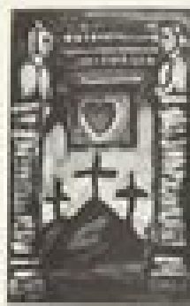
© 2006 The Authors Journal compilation © 2006 Blackwell Publishing Ltd

Figure 10.10: Sampled in the time domain.