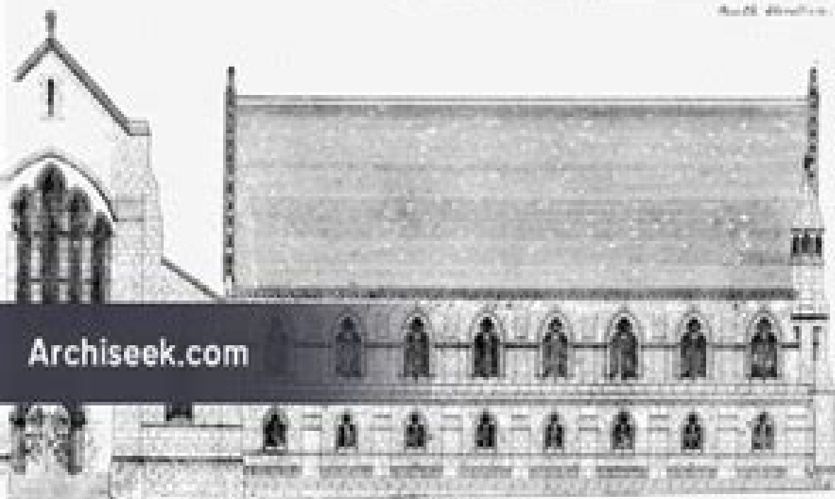
West Wall elevation.