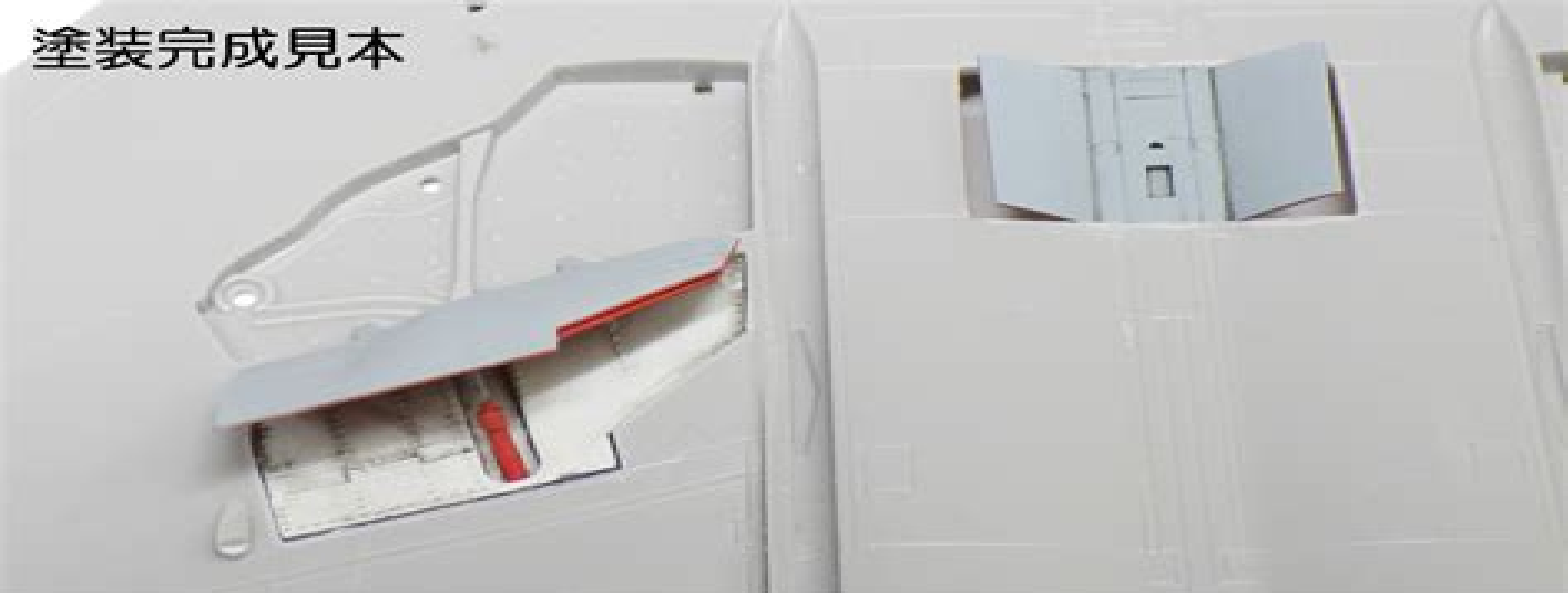
・ Air Brake