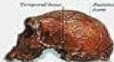
TRILOBITE Fossil SKELETON