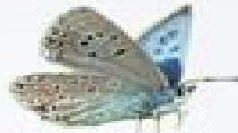
Dutch Alcon Blue Butterfly