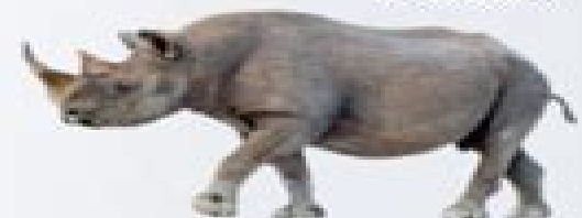
West African Black Rhinoceros