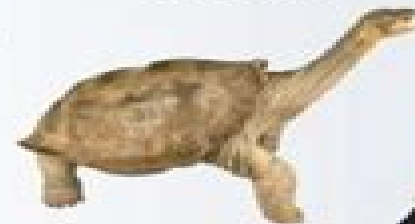
Pinta Island Tortoise