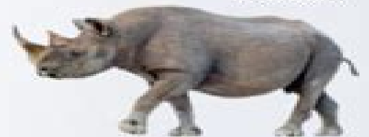
West African Black Rhinoceros