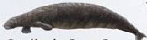
Steller's Sea Cow