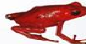
Splendid Poison Frog