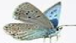
Dutch Alcon Blue Butterfly