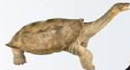
Pinta Island Tortoise