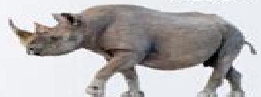
West African Black Rhinoceros