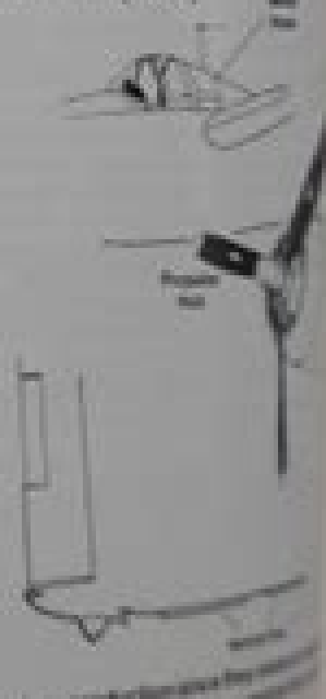
(Left) The propeller spinners were deleted early in production due to performance improvement and were not required for landing.