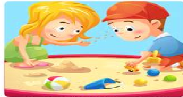
sand in the eyes