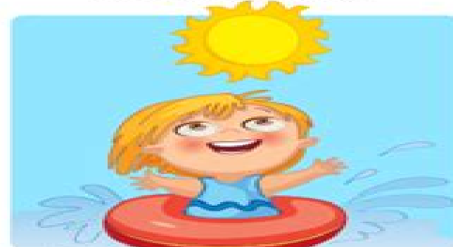
looking at the sun