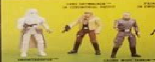
LUKE SKYWALKER™ IN CORUSCORPIO™