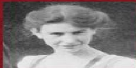
Anna Freud. Daughter