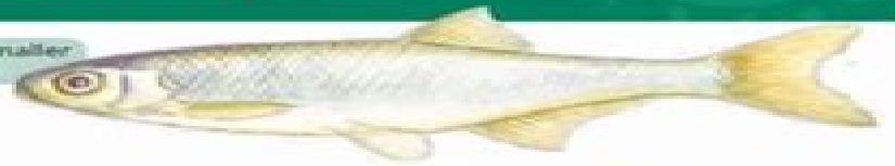
2. Sunbleak Leucospius delineatus 5-7 cm