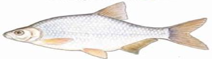
11. Silver Bream Blicca bjoerkna 20-25 cm