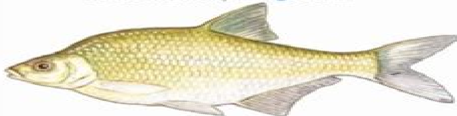
10. Bronze Bream Abramis brama Up to 80 cm