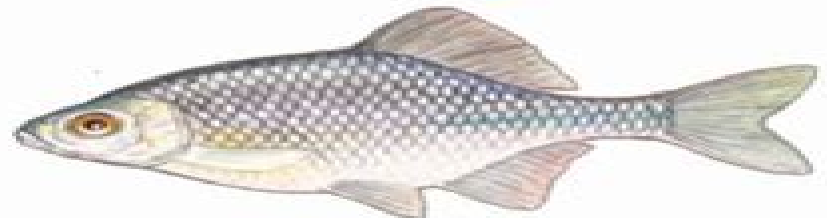
9. Bitterling Rhodeus sericeus 5-9 cm