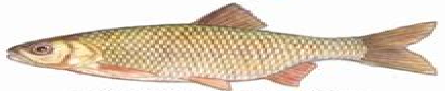
5. Orfe or Ide Leuciscus idus 30-50 cm