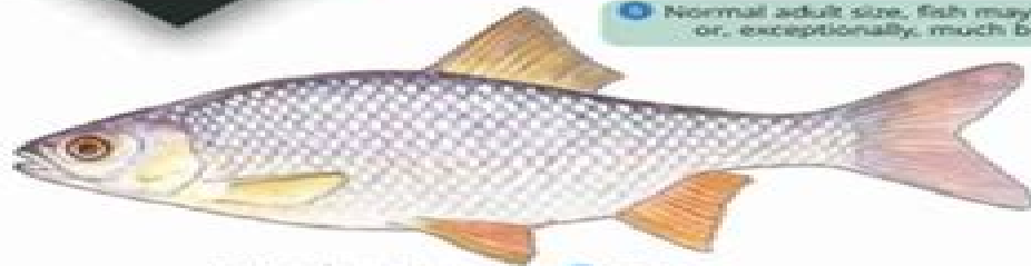
1. Roach Rutilus rutilus 20-45 cm

Normal adult size, fish may be smaller or, exceptionally, much bigger.