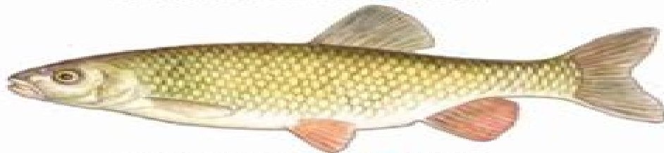
8. Chub Leuciscus cephalus 30-60 cm