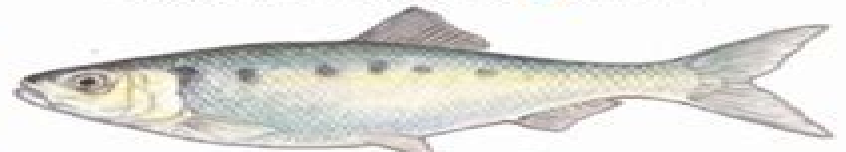
7. Twaiter Shad Alosa fallax 25-40 cm