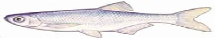
3. Bleak Alburnus alburnus 10-15 cm