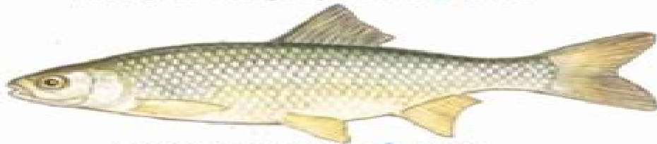
6. Dace Leuciscus leuciscus 20-30 cm