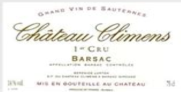
Barsac in Bordeaux