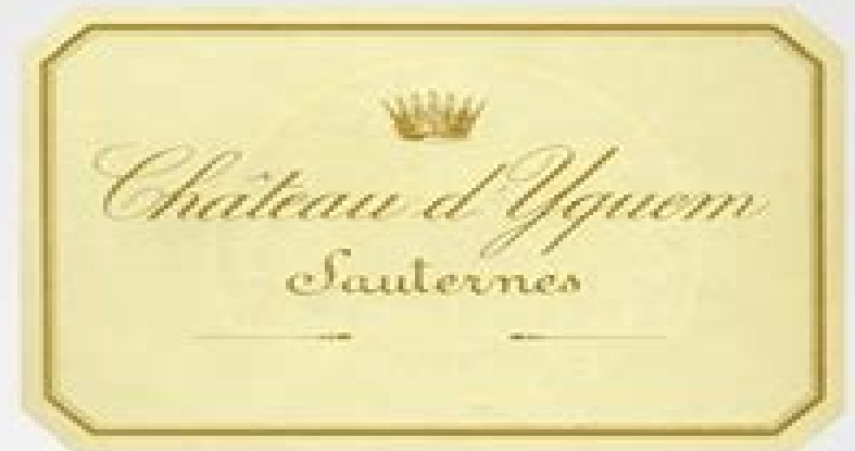
Sauternes in Bordeaux