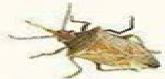
Spined Soldier Bug