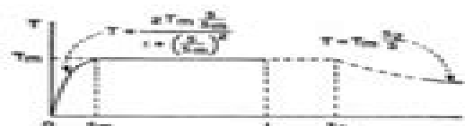
Figure 1. The speed-torque curve of a constant-torque motor.