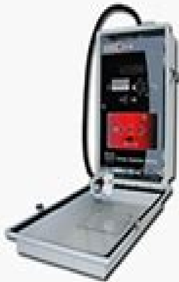
Voltage Regulator Controller