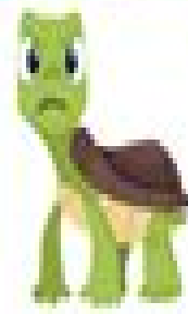
Step 1: Recognize your feelings

Tucker the Turtle was feeling angry Tucker the Turtle was feeling angry Tucker the Turtle was feeling angry Tucker the Turtle was feeling angry Tucker the Turtle was feeling angry