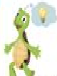
Step 4: Come out when you feel calm and free of a bad day