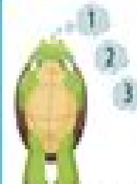
Step 2: Stop your body