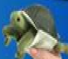
Tucker the Turtle