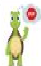
Step 2: Stop your body