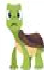
Step 1: Recognize your feelings