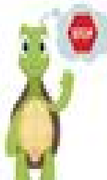
Step 2: Stop your body