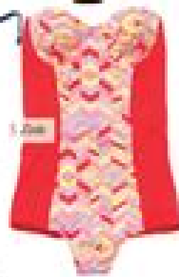
5. J. Cole