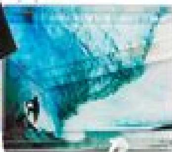
2. Jimmy Choo