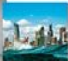
de la Chapelle