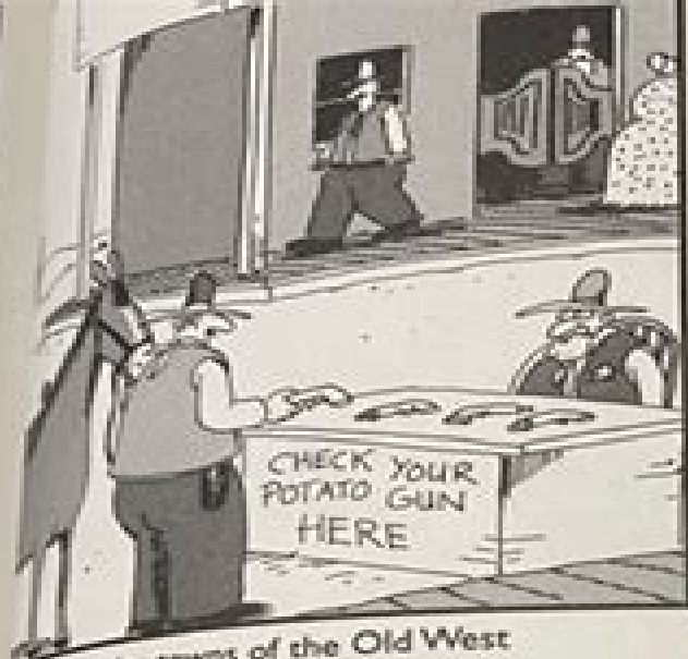
Vegetarian towns of the Old West