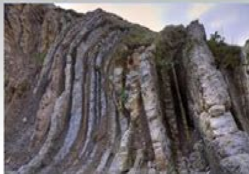
Геодинамика и магматизм

Приведены данные и обобщены различные тектонические факторы, объясняющие наличие в платформе геодинамическую полноту в эволюции Земли, вступлении Загрос-Кавказского сегмента в континентальную субдукцию в связи с вклиниванием ее в Закавказье. Рассмотрены бассейны Мисропаса, разбитые на южные вулканогенно-плутонические пояса и несубдукционные прогибания палеогенового магматизма, который по распространности и спектру рудных элементов значительно превосходит островной магматизм архейства. Доказано, что на трех континентальных этапах развития сегмента давление и нагревание расплавленной литосферы по плоскости срезов в зоне глубокого разлома не являются субдукционными процессами. Рассмотрены также прикладное значение геодинамических исследований в формировании геологических рудно-магматических и нефтегазовых систем. Предлагается глубинно-фронтальное прохождение углеводородов, вследствие структурно-геодинамической полноты распространения магматического поля со зрелой континентальной корой в центральном поле и осадочные карбонатные бассейны с разуплотненной корой на фронтальной окраине геологическим поясом Загрос-Кавказского сегмента. Для построения широтного профиля, структуры и протодинамической модели.