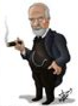
PERS 5 Freud's View of the Human Mind: The Mental Iceberg