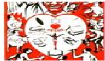
The Victorious Heart