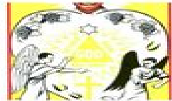
The Heart - The Temple of God