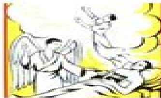
The Glorious Homecoming of the Believer