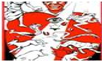
The Heart Convinced of Sin