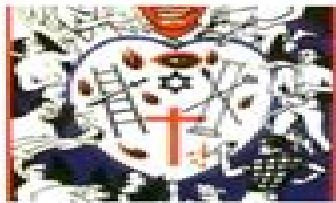
The Tempted and Divided Heart