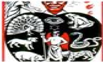
The Sinner's Heart