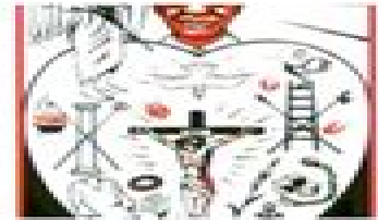
The Crucified Christ