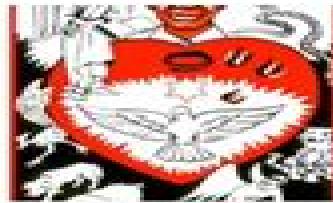
The Repenting Heart