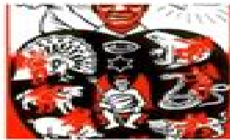
The Heart Hardened By Sin