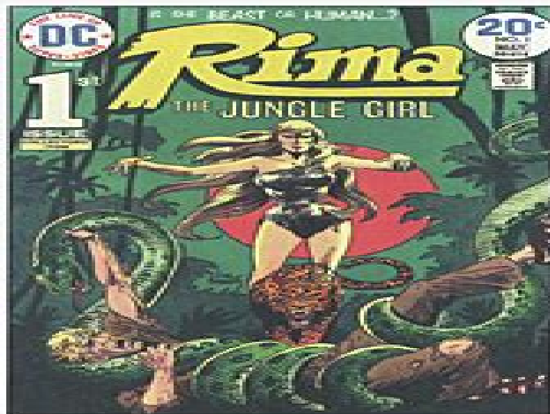
RIMA, THE JUNGLE GIRL #1 April - May 1974. © DC