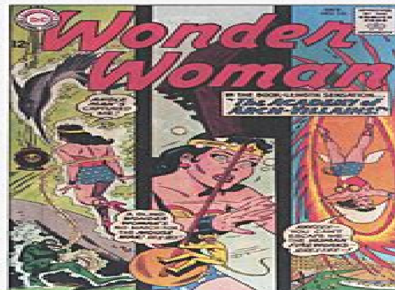
WONDER WOMAN #141 October 1963. © DC