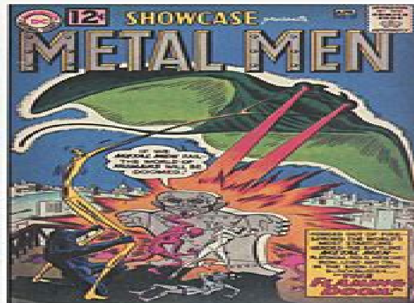
SHOWCASE #37 March - April 1962.