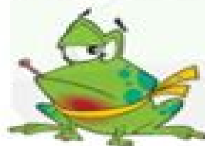
a sore throat