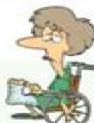
a broken leg