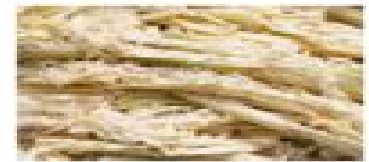
Sugar production by-products