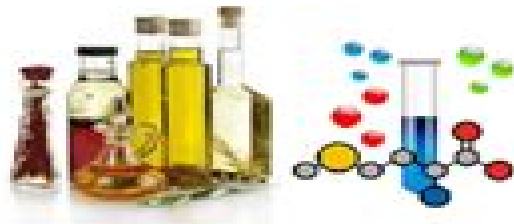
Food application (production of vinegar, oil, edible coatings, and bioactive compounds)