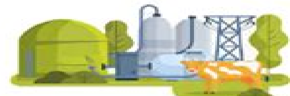
Biogas production application