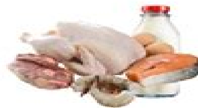
Meat, dairy, fish, and egg by-products