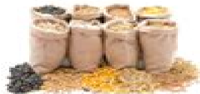
Cereals, nuts, and seeds by-products