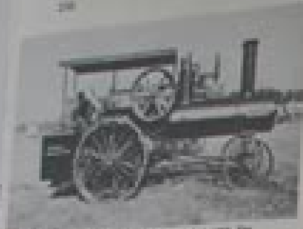
is in the South-west corner-right side is 1975. The map is printed in full colour at 1:250,000 scale and is based on the 1975 Survey of the Eastern shore of New York.