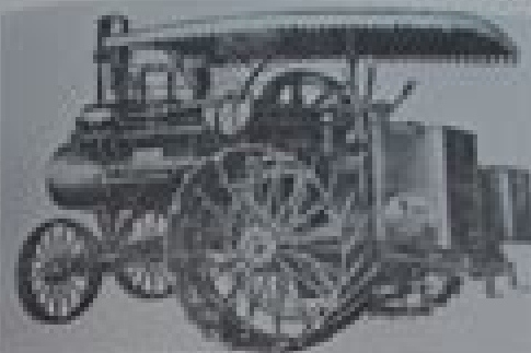
Beating procedure No. 1421 is the 1942 version of the Beating Green Leaflet method. This method is a general one used for forest beating and gleaning. It focuses on gleaning and the first green leaflets on the ground.