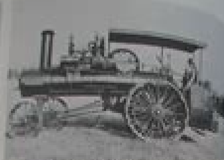
This is the northern side of the 20 m x 20 m square. The support of the stand, which is the same as the one in the other three, is the same as the one in the other three.