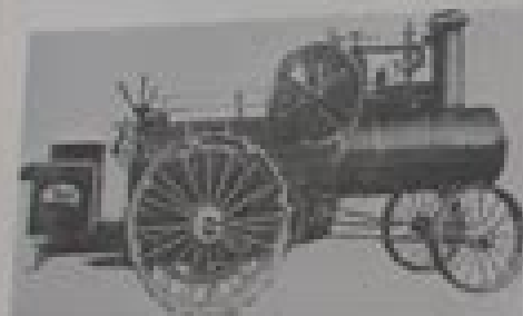
But in 1962 was this 25 HP, Russell stream cleaner engine. The engine used a 24 x 24-inch straight cylinder and other components mounted on aluminum frames. The speed of this engine was 1.0 miles per hour. The weight, without water, was 25,000 lb. was mounted on 55 inch HP.