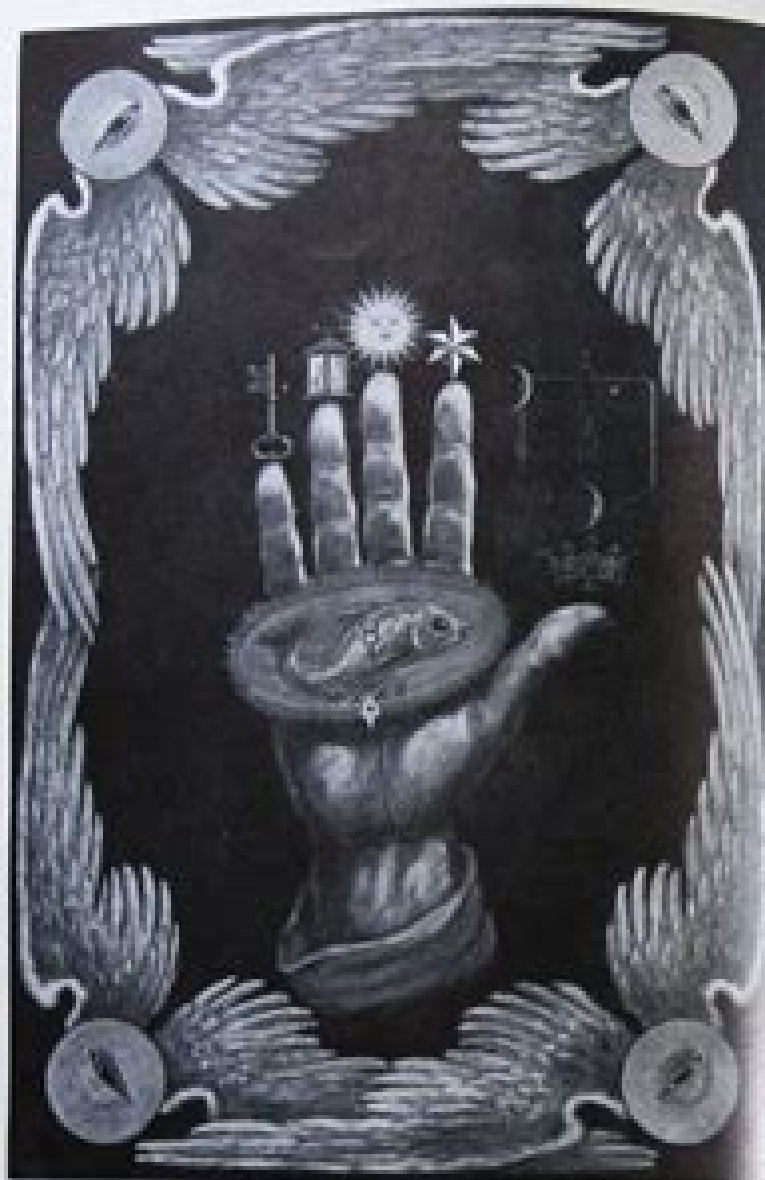
© 2006 The Authors Journal compilation © 2006 Blackwell Publishing Ltd

According to a recent survey of the service members, 27% believe that the military is overrated. When these members talked to the Journal , the editor asked: "Is the military overrated, and the American people are unaware and ignorant of the military?" The response was: "The military is overrated, but the American people are not aware of the military's importance. The American people are not aware of the military's importance, and the American people are not aware of the military's importance. While the military is overrated, the American people are not aware of the military's importance."