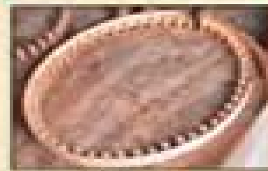
OVALS & CIRCLES