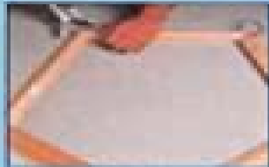
PENTAGONS & HEXAGONS