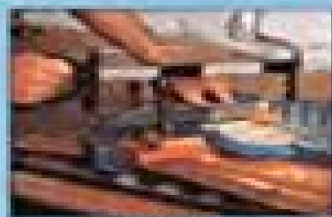
CUTTING THE FRAME