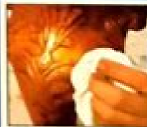
ANTIQUING GOLD LEAF